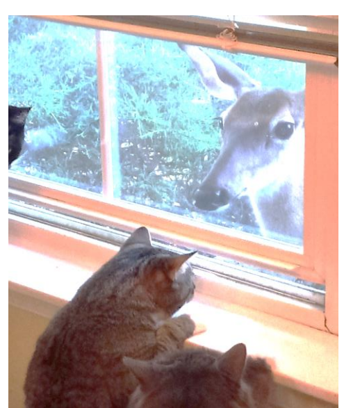
Pepper, Skittles & Costellos Have a visitor in Charlottesville